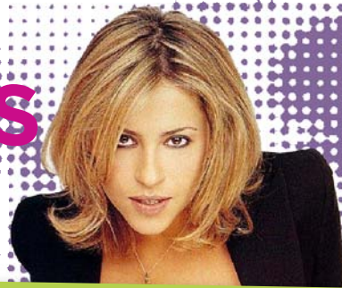
NICOLE APPLETON, MEMBER OF THE BAND 'ALL SAINTS'

'After having my abortion I was in shock. I couldn't believe what I had done. I wanted to kill myself.'