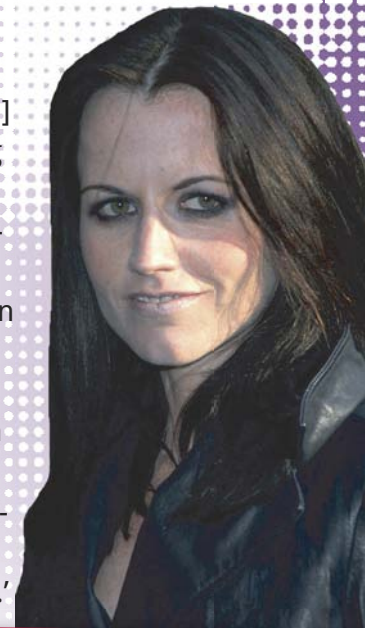
DOLORES O'RIORDAN, LEAD VOCALIST OF 'THE CRANBERRIES'

'It's not good for women to go through the procedure [abortion] and have something living sucked out of their bodies. It belittles women. Even though some women say, "Oh, I don't mind to have one," every time a woman has an abortion, it just crushes her self-esteem smaller and smaller and smaller.'