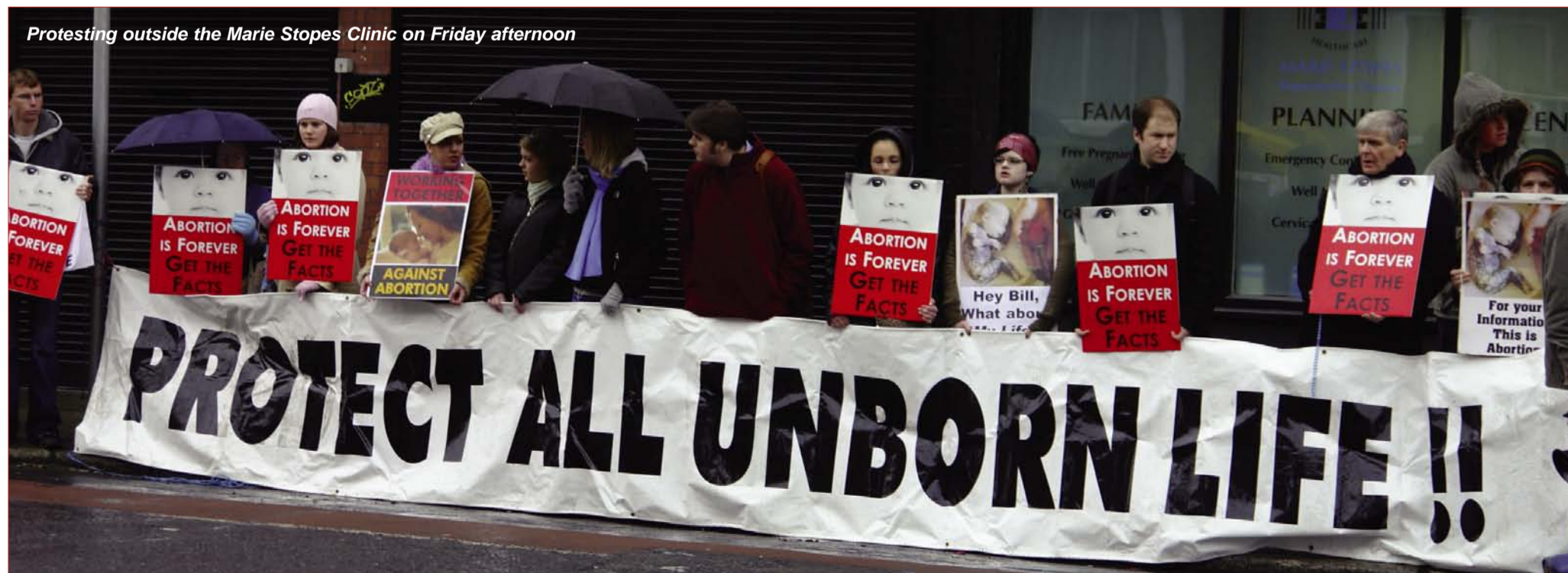
Protesting outside the Marie Stopes Clinic on Friday afternoon