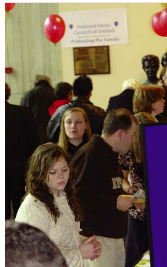
Visiting one of the many booths at the conference. These were popular at break times and lots of new friendships were made