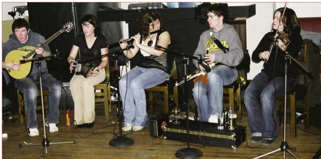
Traditional musicians entertaining the crowd on Friday night of the conference