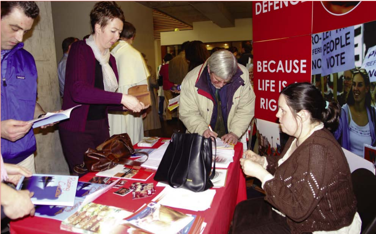
The Youth Defence and Mother & Child Campaign Stalls were busy throughout the three days of the conference